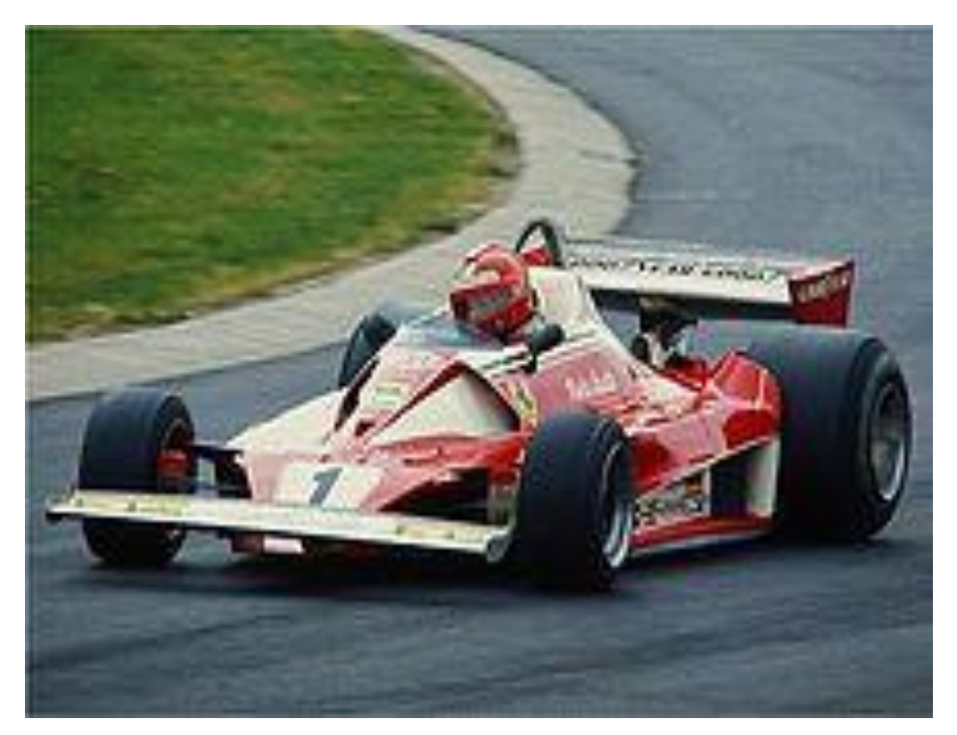
Fig. 3. Example of an image as it will appear at the electronic version of the Journal and a multi-line caption

Please check all figures in your paper both on screen and on a black-and-white hardcopy. When you check your paper on a black-and-white hardcopy, please ensure that the image used in each figure is clear and all text labels in each figure are legible.